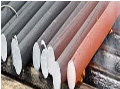
Product: Forged Round Bars

Grade: Carbon Steel Alloy Steel Stainless Steel Tool Steel