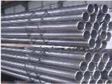
Product: Pipes (WELDED & SEAMLESS)

Grade: Carbon Steel Alloy Steel Stainless Steel