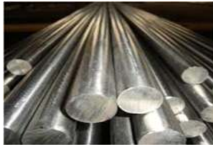
Product: Rolled Round Bars

Grade: Carbon Steel Alloy Steel Stainless Steel Tool Steel